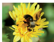
Bees love weeds.

Bees are a vital part of our ecosystem. They pollinate our food and help create the air we breathe. Here are three top tips on how to Bee a Helper :