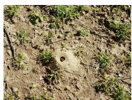
Solitary bee hole.