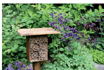
Food and shelter!